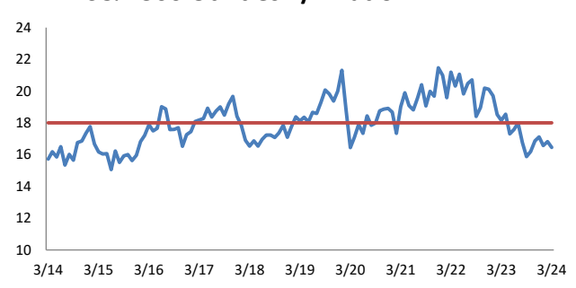
S&P 500 Utilities P/E Ratio FY1

Source: FactSet, 3/28/24. The S&P 500 Index is based on the average performance of around 500 widely held common stocks. The S&P 500 Utility Index consists of 30 utility companies within the S&P 500 Index. These are unmanaged indexes and cannot be invested in directly. Past performance is no guarantee of future results.